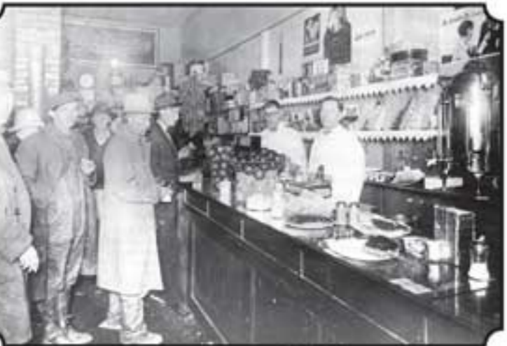
Snappy Lunch, 1923