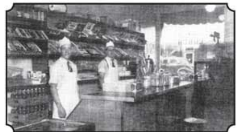
Snappy Lunch, 1935